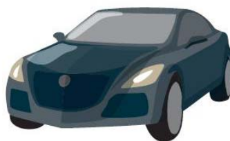
Admissions Package (Lexus) included