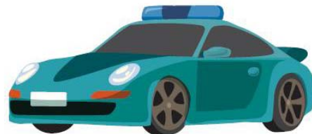
Private Tutoring (Porsche) included