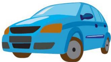
Classroom Course (Ford) $1,999-2,099

Deep Discounts. Our competitors love to lure students with promotional discounts and limited-time offers. Remember, however, that the discounts they promote are only a reduced price for the classroom-only "Ford" product. Because you still do NOT receive the additional "Lexus" or "Porsche," they are hardly a real value. At Altius any student can purchase all three services, at any time, for a very reasonable price of $1,849. Purchasing all three services from our competitor would cost $5,879. That is a discount of over $4,000!