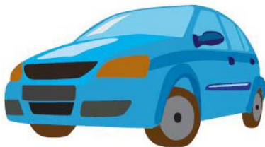
Classroom Course (Ford) $1,849